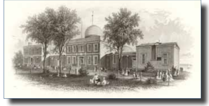
New Naval Hospital/Naval Observatory now BUMED

Built behind the Old Naval Observatory at 23rd and E Streets NW, the "New Naval Hospital" included quarters for sick officers and nurses, a contagious disease building, and administrative offices. From that day to this, the original Navy hospital on Pennsylvania Ave. came to be known as the "Old Navy Hospital." The "New Naval Hospital", along with the Naval Medical School, became the Naval Medical Center in 1935. To this day, these historic buildings are an integral part of navy medicine, housing the current location of BUMED and the offices of the Surgeon General of the Navy.