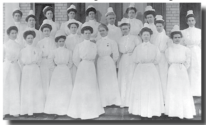
1908: The first Navy Nurses "The Sacred Twenty" were also the first women accepted into the Navy.

In 1843, patients from the medical facility were transferred to the Marine Barracks at 8th and I Streets. In 1866, during the Civil War, Congress