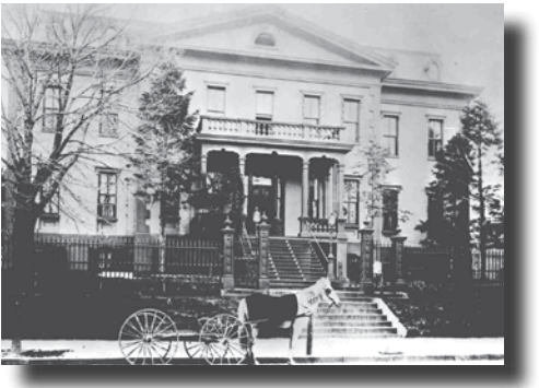
Old Navy Hospital Pennsylvania Ave. 1866.

ince the infancy of our Nation , when drugs often did more harm than good and surgeries took place whenever and wherever possible, military medicine in the U.S. has grown to be in the forefront of modern medicine and has led the way in innovative emergency quality care in remote and dangerous environments.