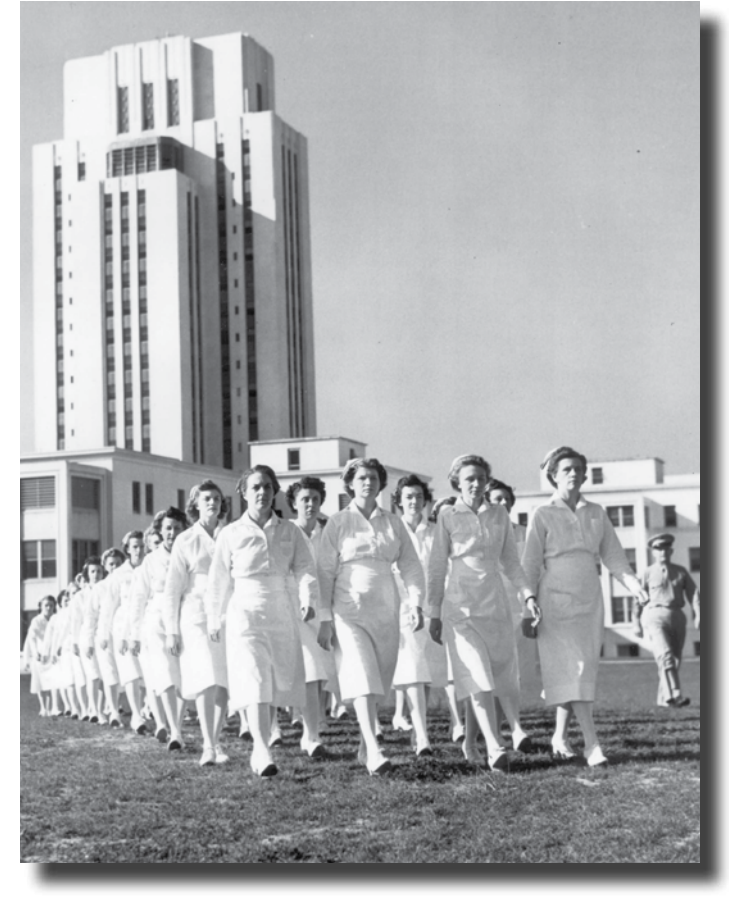
Navy nurses during greensward maneuvers at the call of a Marine. 1944.