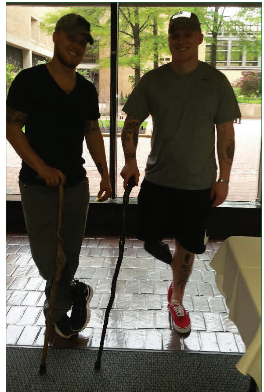
Top right: Wounded soldiers are seen with the hand carved walking canes that were donated by Omega Staffs of Newton, Alabama. The canes assist wounded warriors with walking stability.